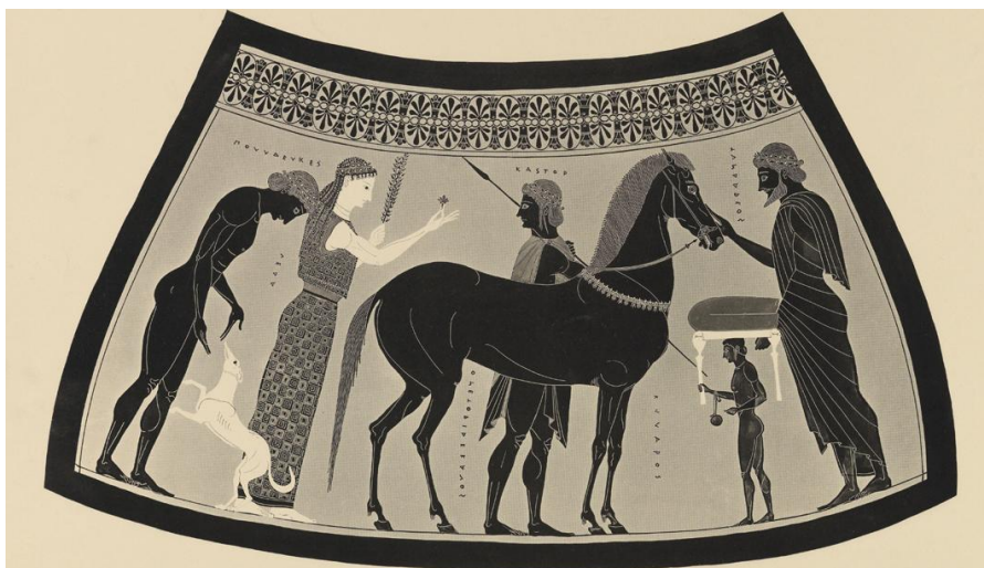
Fig. 13: Attic black-figure amphora, ca. 540-530 BC. Vatican City, Museo Gregoriano Etrusco Vaticano 344. Drawing after Furtwängler, A. and K. Reichhold (1932), Griechische Vasenmalerei , Munich.