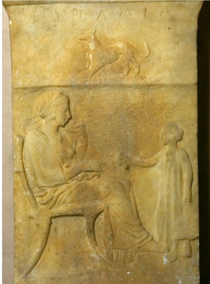
Figs. 20a-b: Attic grave stele of Eutamia, 420-400 BC. Athens, National Archaeological Museum 911.