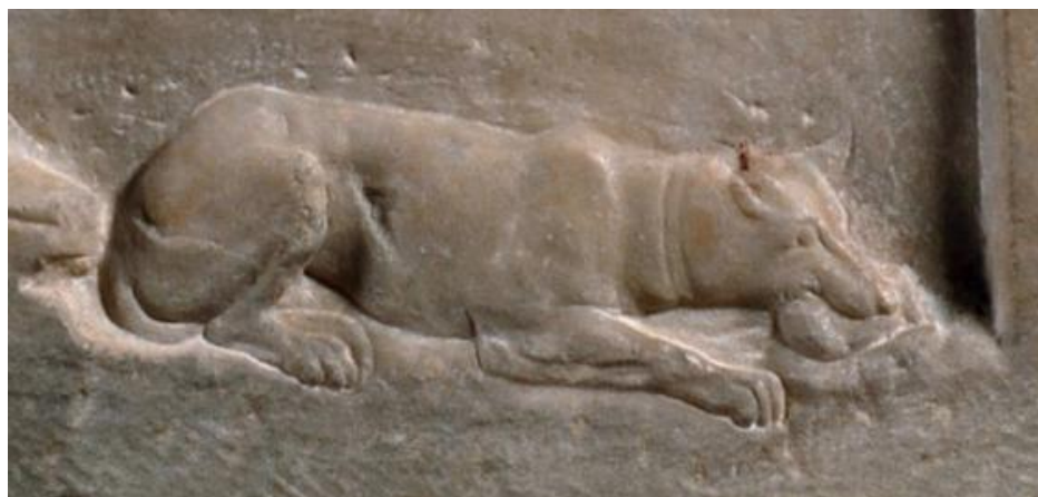
Fig. 8b: Detail of banquet relief, late 5th cent. BC. Athens, National Archaeological Museum 1501.