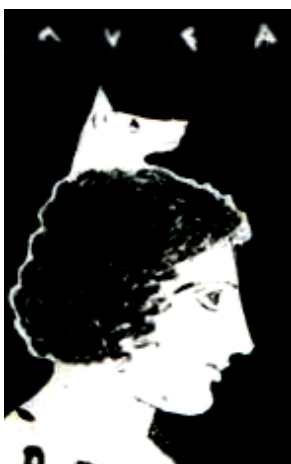
Fig. 23: Detail of Boston, Museum of Fine Arts 00.346 (Fig. 21). Sketch: Katia Margariti.