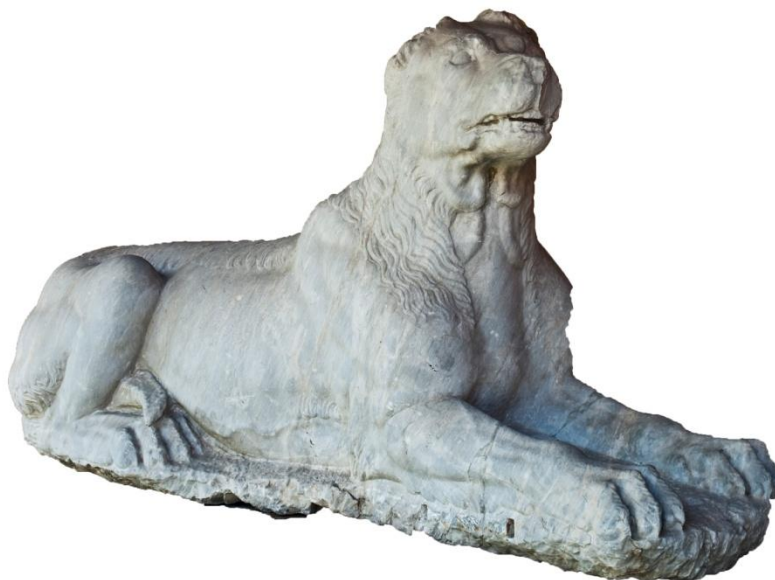
Fig. 5: Funerary statue of a Molossian from the Kerameikos cemetery, second half of the 4th cent. BC. Kerameikos Archaeological Museum P670.