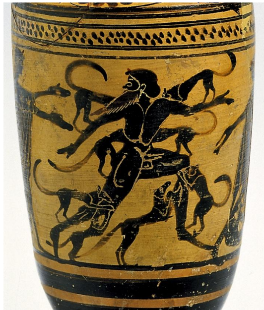
Fig. 21: Attic black-figure lekythos, 525-475 BC. Athens, National Archaeological Museum 883.