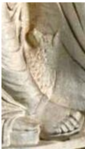
Detail of Attic grave stele of Korallion