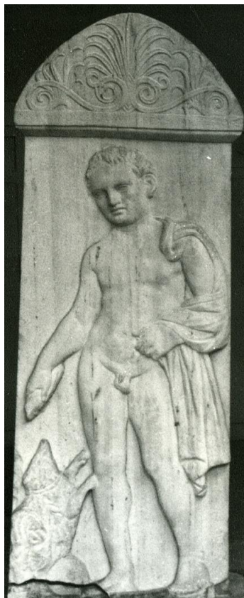
Fig. 14: Attic grave stele of Pamphilos, 375-350 BC. Athens, National Archaeological Museum 1980. MINISTRY OF CULTURE - © NATIONAL ARCHEOLOGICAL MUSEUM (photo: Dimitrios Gialouris).