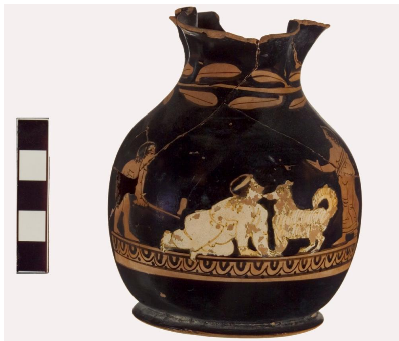
Fig. 12: Attic red-figure chous, end of 5th cent. BC. Athens, Agora Museum P 20090.