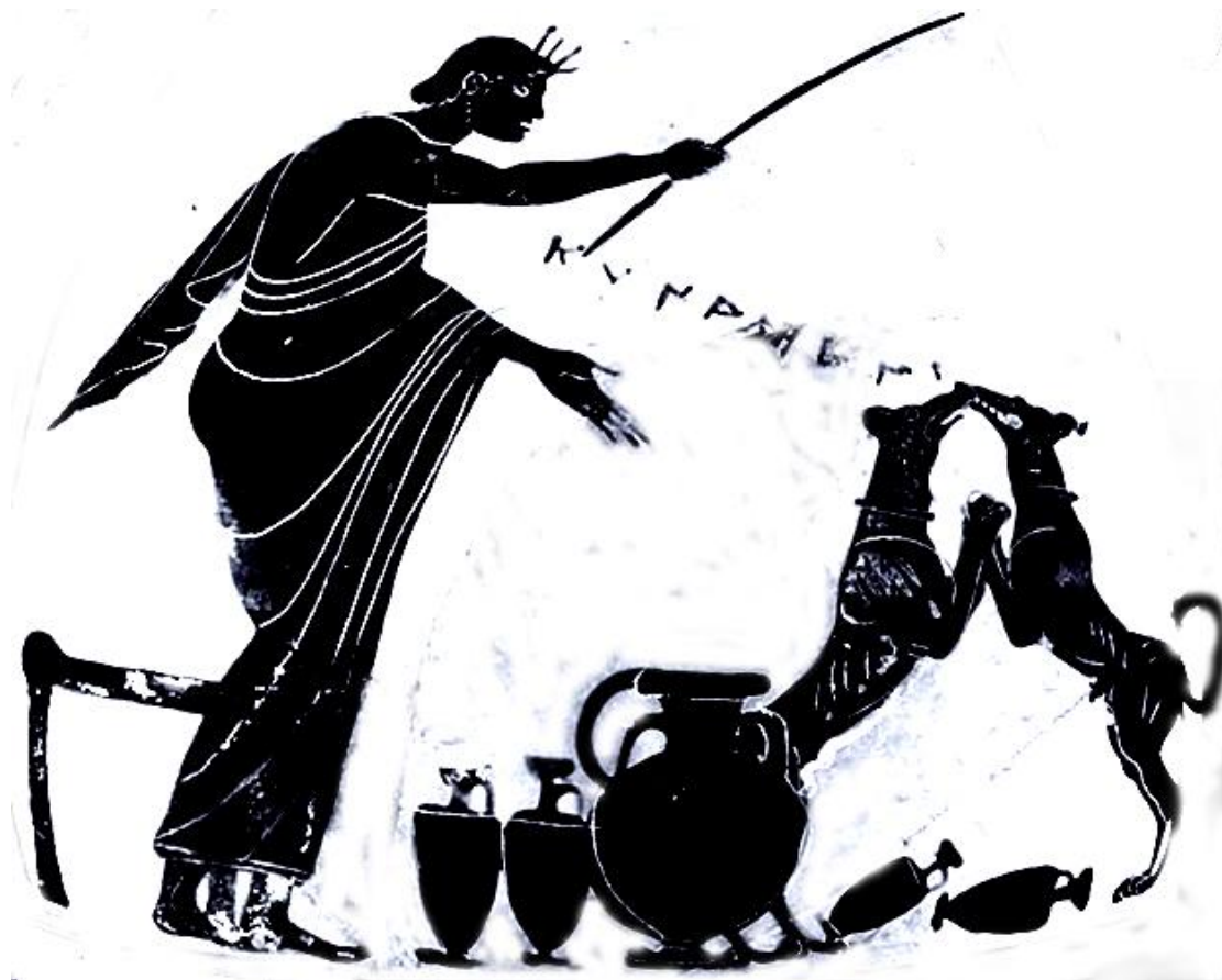
Fig. 24: Attic black-figure pelike, ca. 520-500 BC. Florence, Museo Archeologico Etrusco 72732. Sketch: Katia Margariti.