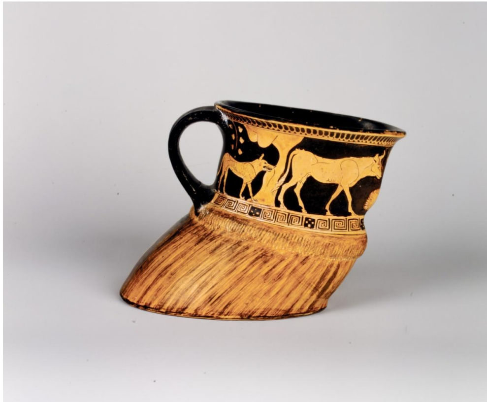
Fig. 4a: Attic red-figure vase shaped like a cow’s hoof, ca. 470-460 BC. The Metropolitan Museum of Art, New York (Fletcher Fund, 1938), inv. no. 38.11.2.