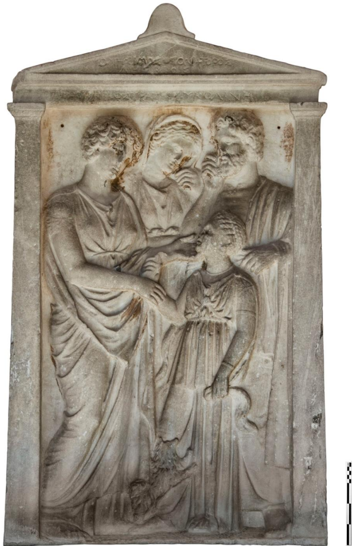
Figs. 16a-b: Attic grave stele of Eukoline, second half of the 4th cent BC. Kerameikos Archaeological Museum P 694 / I 281.