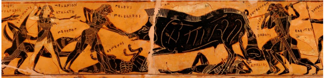
Fig. 3: Attic black-figure volute krater (Francois vase), ca. 570-560 BC. Florence, Museo Archeologico Etrusco 4209. Photo: courtesy of the National Archaeological Museum of Florence (Regional Directorate of Tuscany Museums). Image reproduction is strictly prohibited.