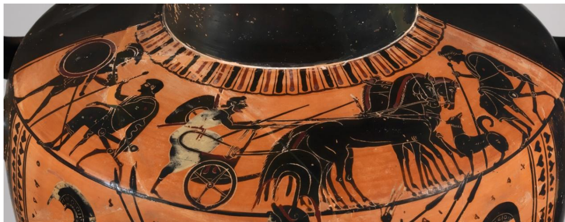
Fig. 7: Attic black-figure hydria, ca. 510 BC. The Metropolitan Museum of Art, New York (Fletcher Fund, 1956), inv. no. 56.171.29.