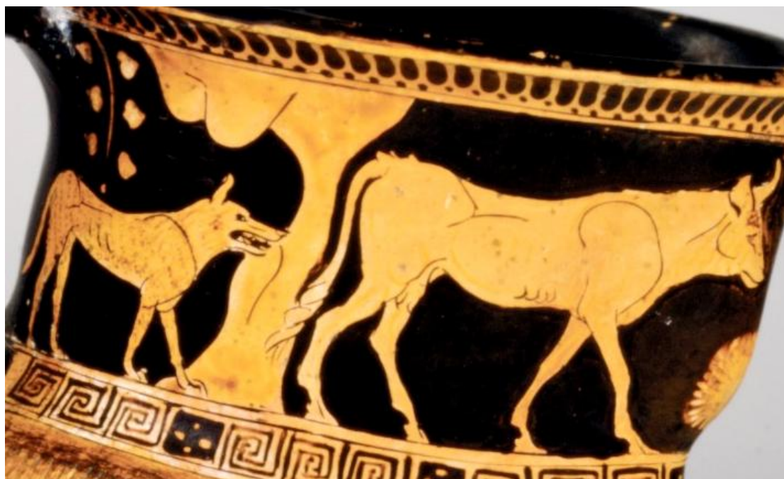
Fig. 4b: Detail of Attic red-figure vase shaped like a cow's hoof, ca. 470-460 BC. The Metropolitan Museum of Art, New York (Fletcher Fund, 1938), inv. no. 38.11.2.