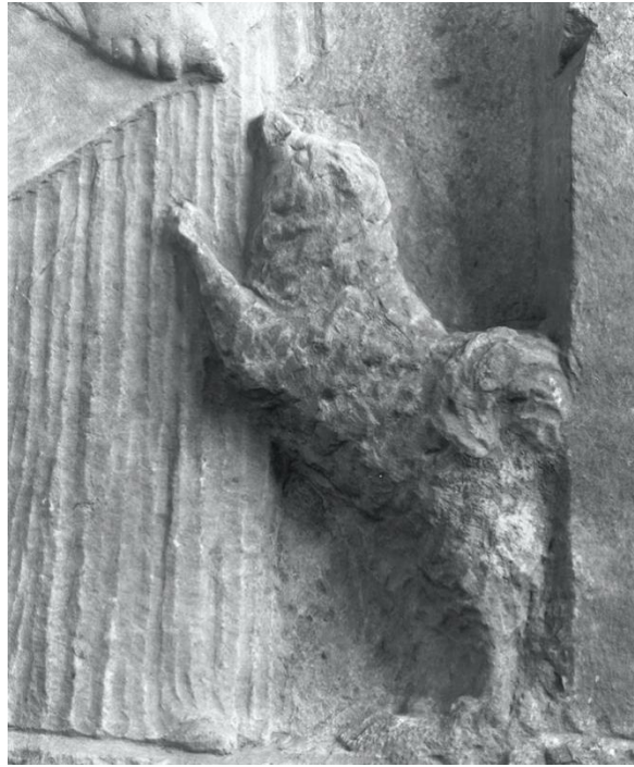
Detail of Attic grave stele of a young girl, ‘Melisto’ (above).