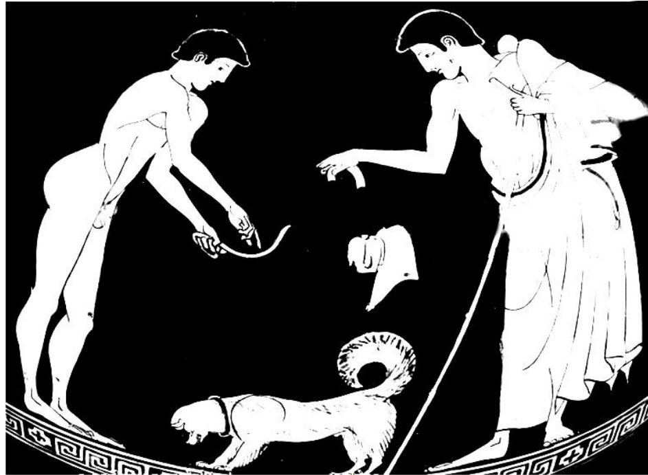
Fig. 10: Attic red-figure hydria, ca. 480 BC. Berlin, Antikensammlung F2178. Sketch: Katia Margariti.