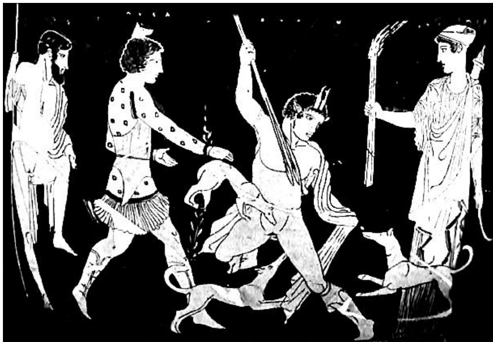
Fig. 22: Attic red-figure bell krater, ca. 440 BC. Boston, Museum of Fine Arts 00.346. Sketch: Katia Margariti.