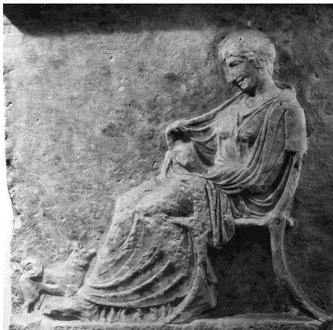
Fig. 18: Attic grave stele of a woman, 420-400 BC. Athens, National Archaeological Museum 882. MINISTRY OF CULTURE - © NATIONAL ARCHEOLOGICAL MUSEUM (photo: Tasos Vrettos).