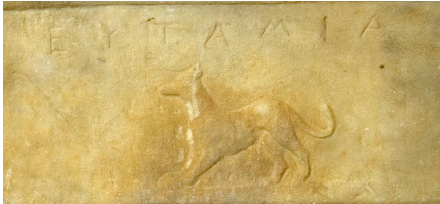
Detail of Attic grave stele of Eutamia