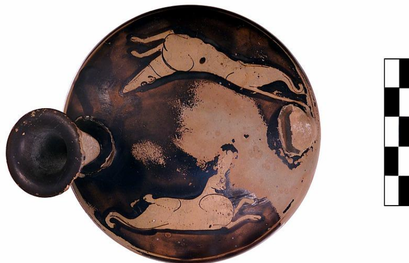
Fig. 1 - Attic red-figure askos, ca. 430 BC. Athens, Agora Museum P5330.