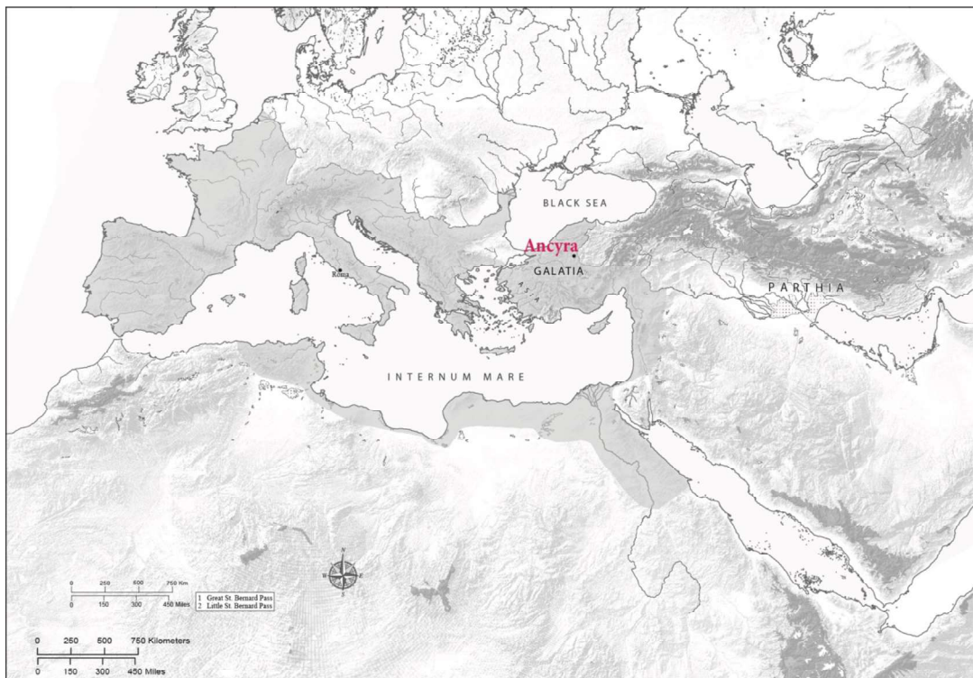
Map showing the location of Ancyra in the Augustan Rome. (AWMC: Map 8.2 Expansion of the Empire in the Age of Augustus)

On the other hand, all the seven Qin stelae were erected on mountains which were located also in the newly conquered eastern territories of the empire, at the outermost points away from the then capital Hsien-yang which lies in the west.